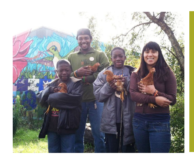
Richmond youth holding young chickens

The Richmond Food Policy Council was formed in December 2011 to "create a local, equitable, and sustainable food system based on regional agriculture that fosters the local economy and provides healthy affordable food for all people living in Richmond." Their policy development and advocacy have shaped local policy in coordination with the local city government and school district. Most recently, the City of Richmond has been actively working with the Richmond Food Policy Council on an Urban Agriculture Ordinance that aims to support local