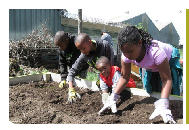
Richmond youth till soil at Adams Crest Farm

In addition, Richmond still faces extreme underenrollment in California's Supplemental Nutrition Assistance Program (SNAP), CalFresh. According to the Contra Costa County Employment and Human Services, approximately 40 percent of Contra Costa County residents who are eligible for federal food assistance programs are not enrolled. No data was available for underenrollment percentages in the city of Richmond, but it is possible that this percentage is higher than 40 percent for Richmond residents. This is despite the fact that enrollment in Contra Costa County's CalFresh program has increased 410% from 2006 to 2014. Currently, there are about 6,000 Richmond households (approximately 15,000 individuals) enrolled in CalFresh, out of a total population