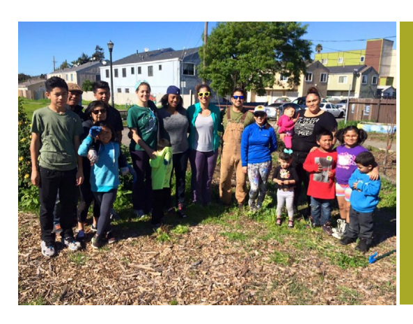
Volunteers working at garden on Richmond Greenway

While these food procurement goals are commendable, there is still room for improvement—not only in procurement, but also to better ensure that small to mid-sized farms have access to local markets. In addition, procurement strategies at UC Berkeley could be leveraged with other anchor institutions so that they have a broader reach and