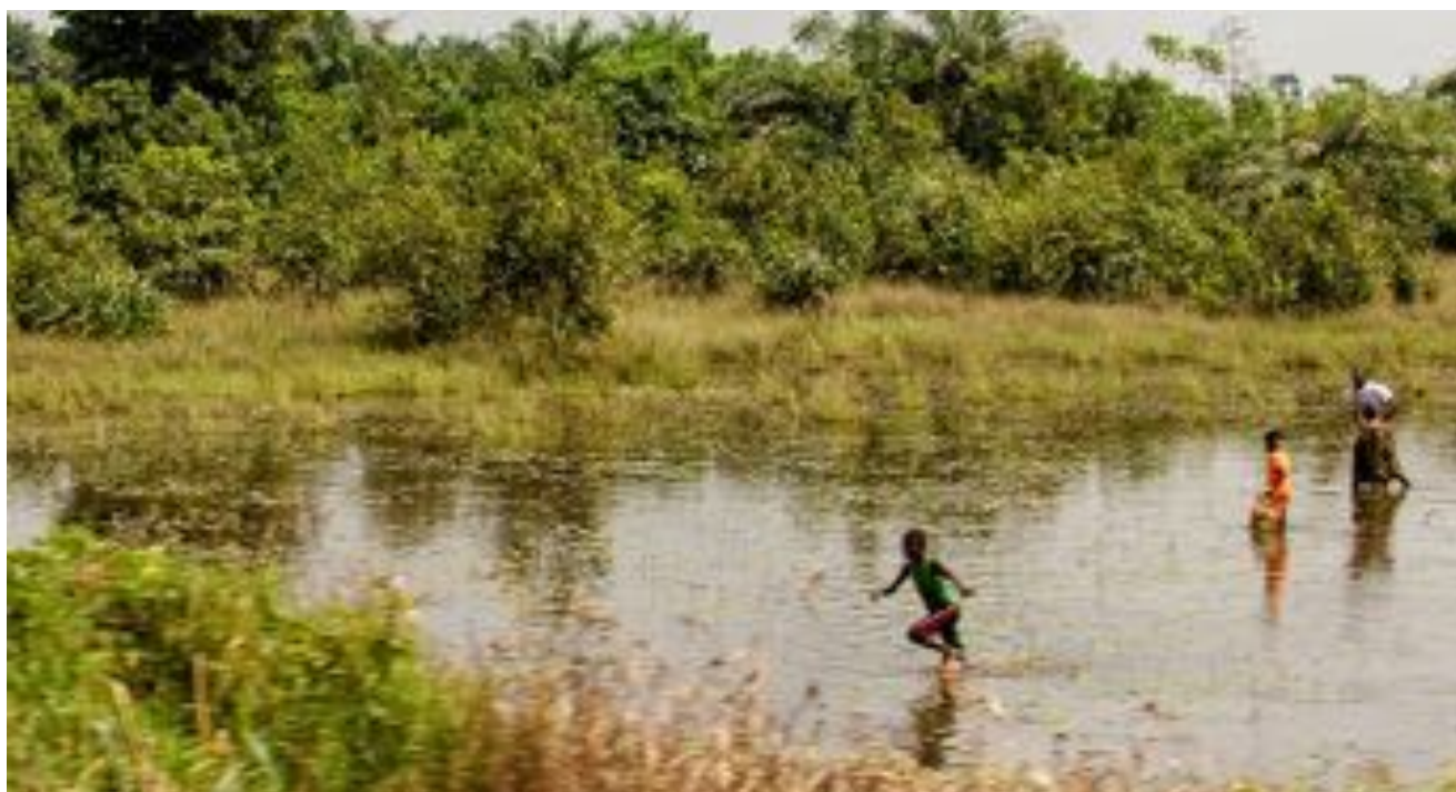
Wetland areas in Liberia are a source of food for rural and periurban communities.

If you’ve ever signed a lease or purchased property you may have an inkling of how complicated land ownership can be. So just imagine navigating land rights in other countries and cultures, with their own sets of laws and customs. It often