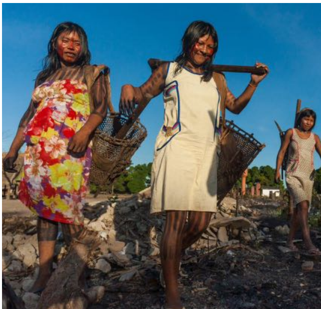
Indigenous villagers, Brazil.

Nia Tero utilizes what they call "place-anchored partnerships," to develop relationships with Indigenous peoples who live in a collective territory or place along with their partners and chosen allies. The term is specific to