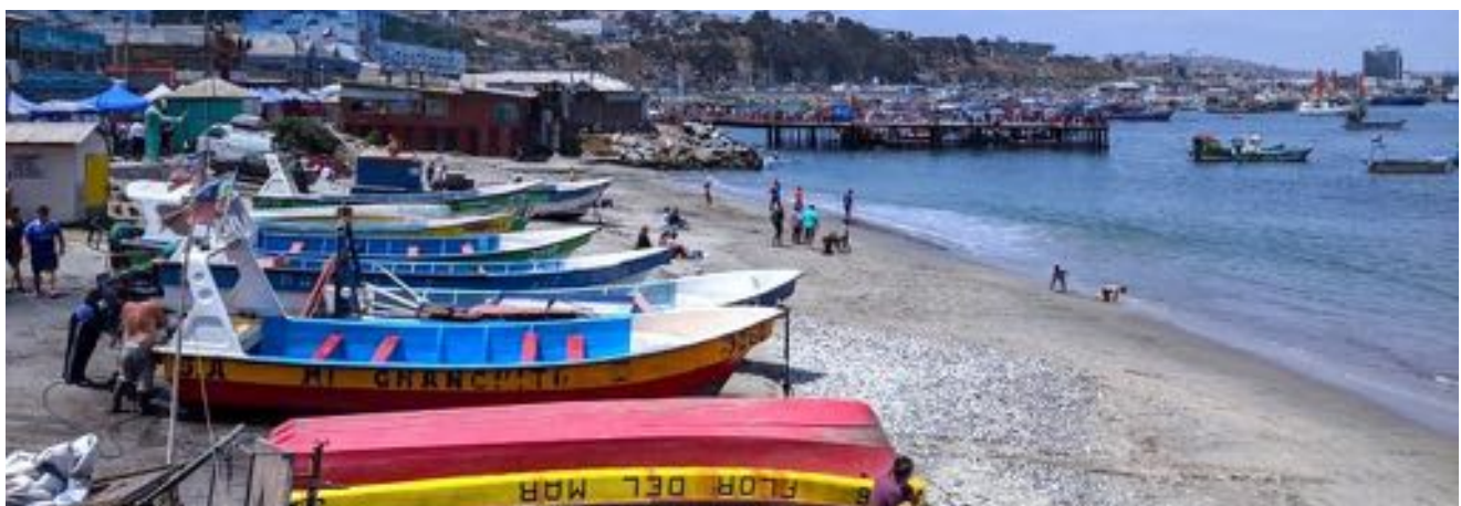
Boats arranged on the beach in Paita, Peru.

While our team has always been concerned about climate, and passionate about creating positive environmental impacts, we now prioritize climate change mitigation as a key design principle in our work. We were galvanized by 2019's IPCC reports, and the global youth movement dedicated to ensuring our planet and every species on it—including us—have a healthy future to look forward to. We know it's not going to be easy, but we were never about "easy" at Future of Fish. As a systems-change organization, we dive head-first into the wicked problems facing our oceans and coastal communities, and there is no greater system-challenge than addressing climate change. Climate justice is interwoven with everything we do to protect the future of fish, the communities that rely on them, and the oceans that support us all.