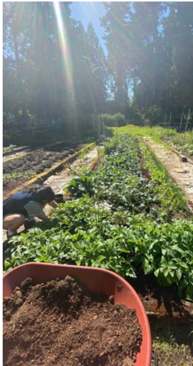
Na'ah Illahee community garden.

Na'ah Illahee Fund is focused on climate justice because the Indigenous way of life was sustainable for tens of thousands of years. And to a large degree, Native people still live very close to the land, yet they are disproportionately impacted by climate change and changes to the environment.