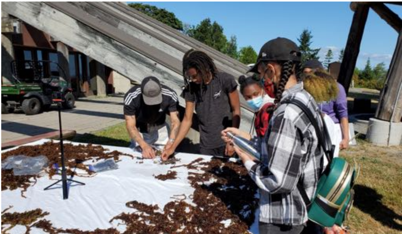
Na'ah Illahee Youth Trails Program.

Civic engagement (or “Wise Action”) is one major way that Na'ah Illahee Fund is building leadership in Indigenous