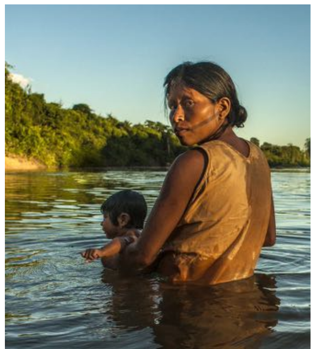
Indigenous woman bathing child, Amazonia.