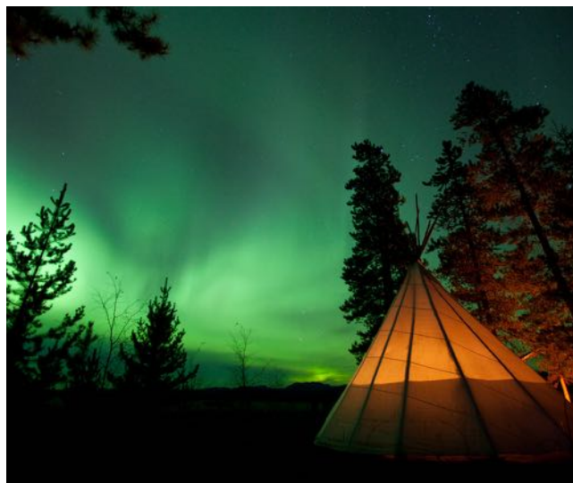
Sahtu Dene homestead in boreal forest, Canada.