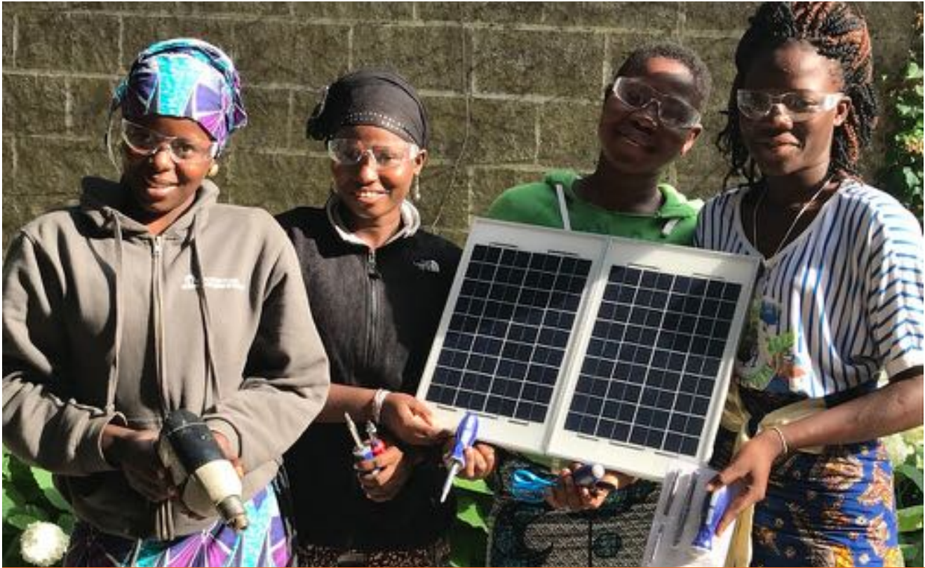
Nigerian women trainees.